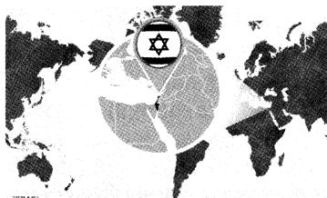
Israel the centre of the world

Whilst the whole world will be involved (Jeremiah 25:29-33), the Middle East will be the main area of conflict. Russia's drive south will draw "all nations to Jerusalem to battle" (Zechariah 14:2). The city will fall to Gog's onslaught, and the Jews, together with their British and American allies, will be driven back.