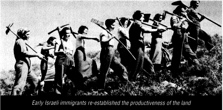
Early Israeli immigrants re-established the productiveness of the land

largely an army of farmers. Much of its weaponry and uniforms are stored in the homes of the soldiers, and in times of emergency they leave their farms, their orchards, their rural settlements to defend their country. Israel is literally a land of “unwalled villages.”