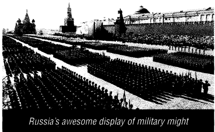
Russia’s awesome display of military might

Statesmen and scientists realise the grim possibility of this. They know that one day, perhaps without warning, there could pour out of the heavens, from the ballistic missiles fired thereinto, a rain of destruction upon the cities beneath. So that, today, there is found a fulfilment of the words of the Lord Jesus Christ, “... upon the earth there shall be distress of nations, with perplexity ...Men’s hearts