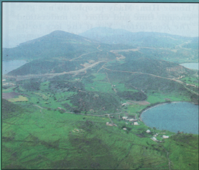
PATMOS - a volcanic, rocky island, about 50km southwest of Samos, in the Aegean / Mediterranean Seas

AN OUTLINE OF WORLD EVENTS REVEALED BY JESUS CHRIST